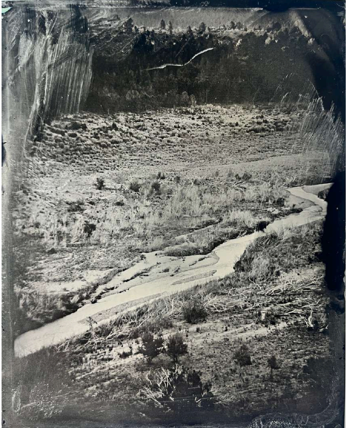
"River Tus", Wet Plate Collodion, 4x5 inches 2025