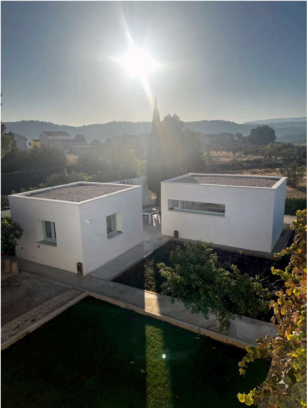
The artist studios in the country, Spain.