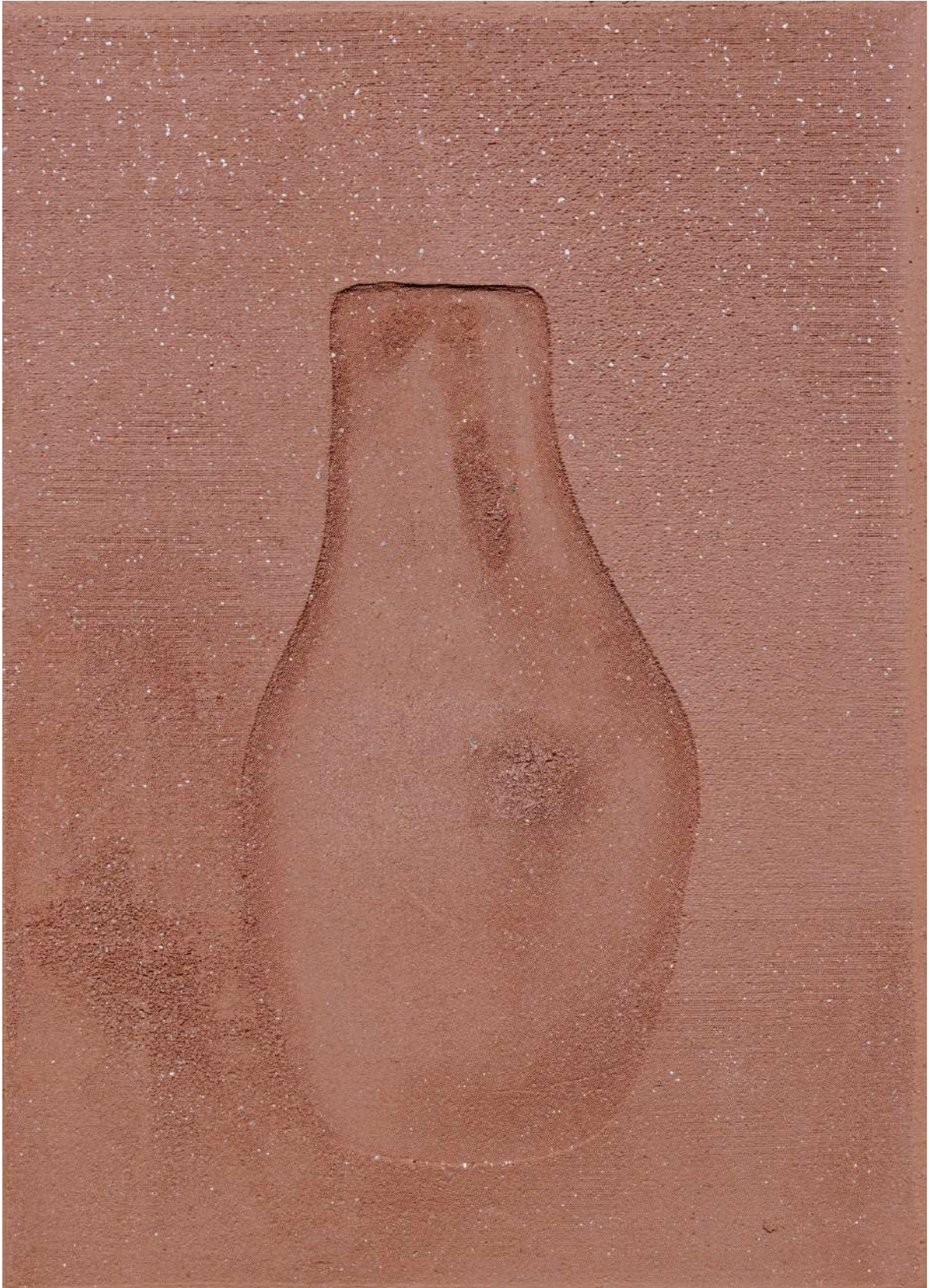
"Holy Cow" bottle, clay engraving from a photographic still life. 21 x 29cm. 2025