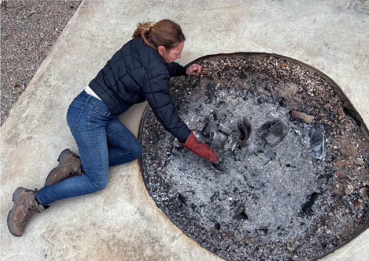
The artist and her pit fire at her country studios, Spain, 2025.