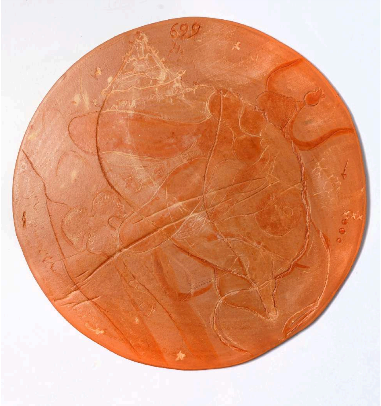
The Shell of 699 Anne St, Incisions on Clay, 35x35 cm 2025