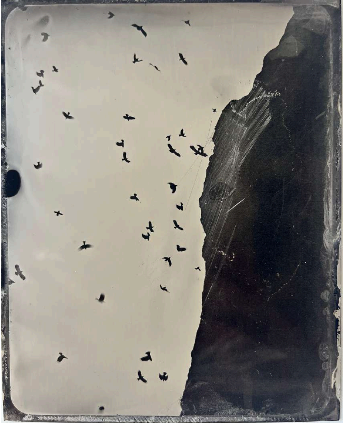
Party of Crows, Wet Plate Collodion, Peñarrubia, 4x5 inches 2025