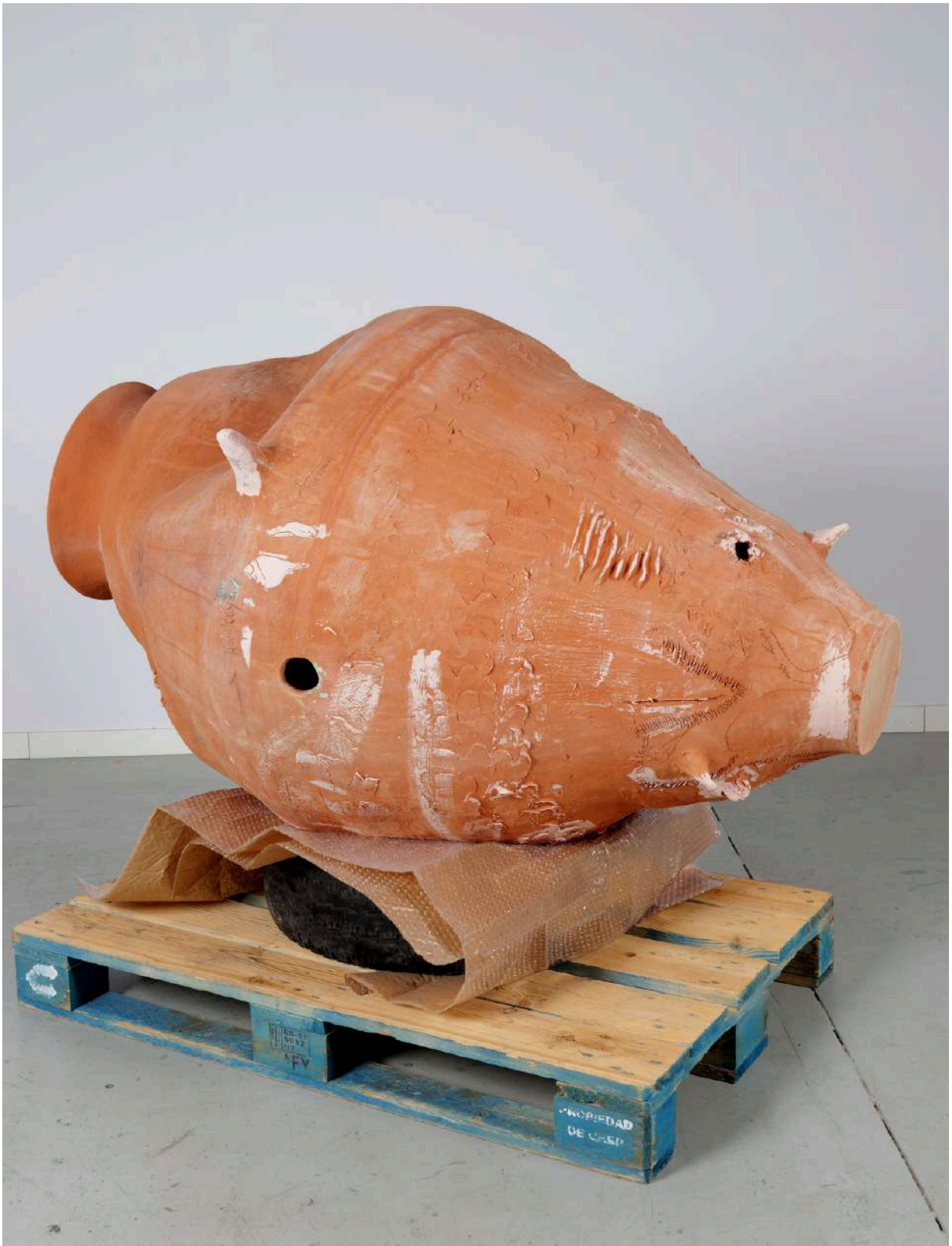
"Pigfish" wild spanish clay large vessel ceramic work. "La voz es ella" project. 75 x 145cm. 2024