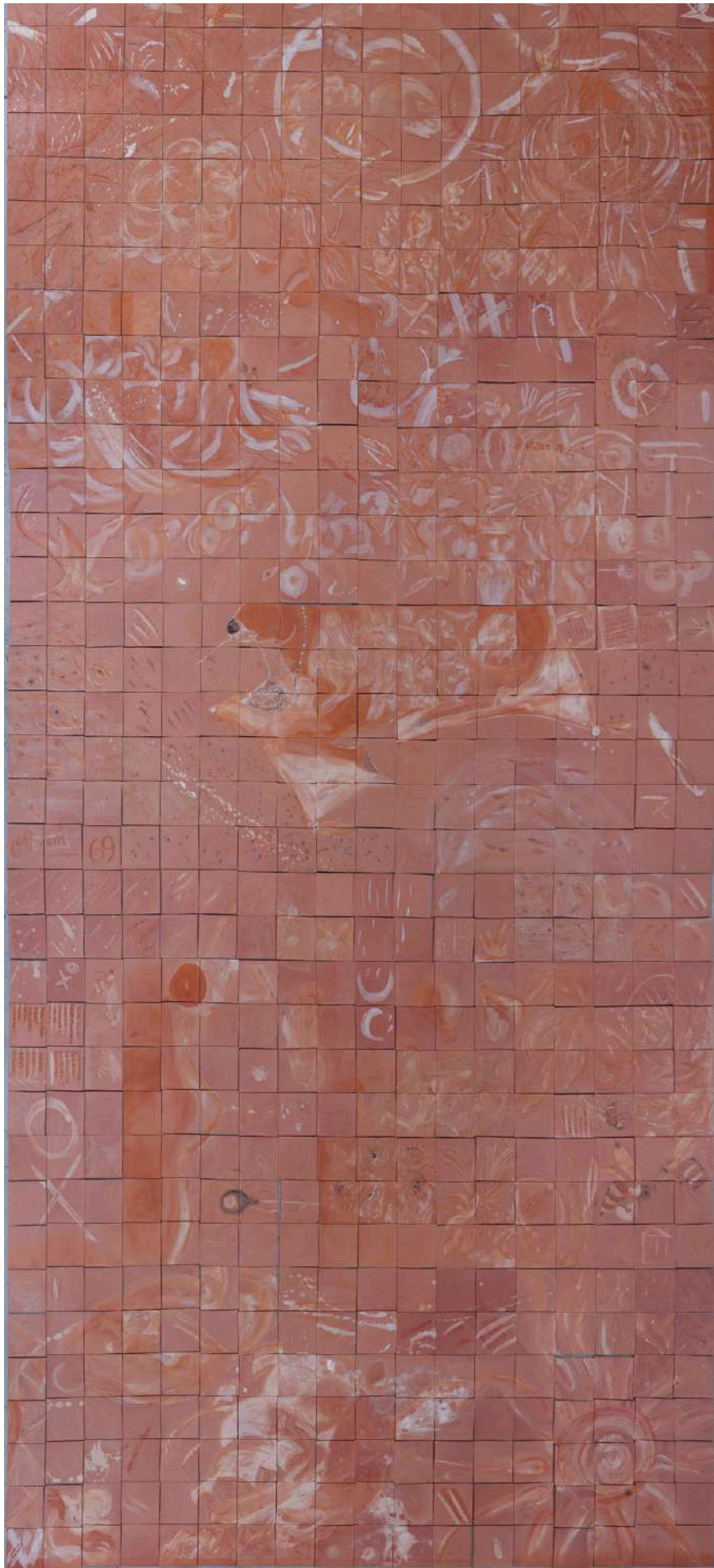
Ceramic Mural "Las Musas" Commissioned Project Los Gabrieles 2025 6 x 3 meters.