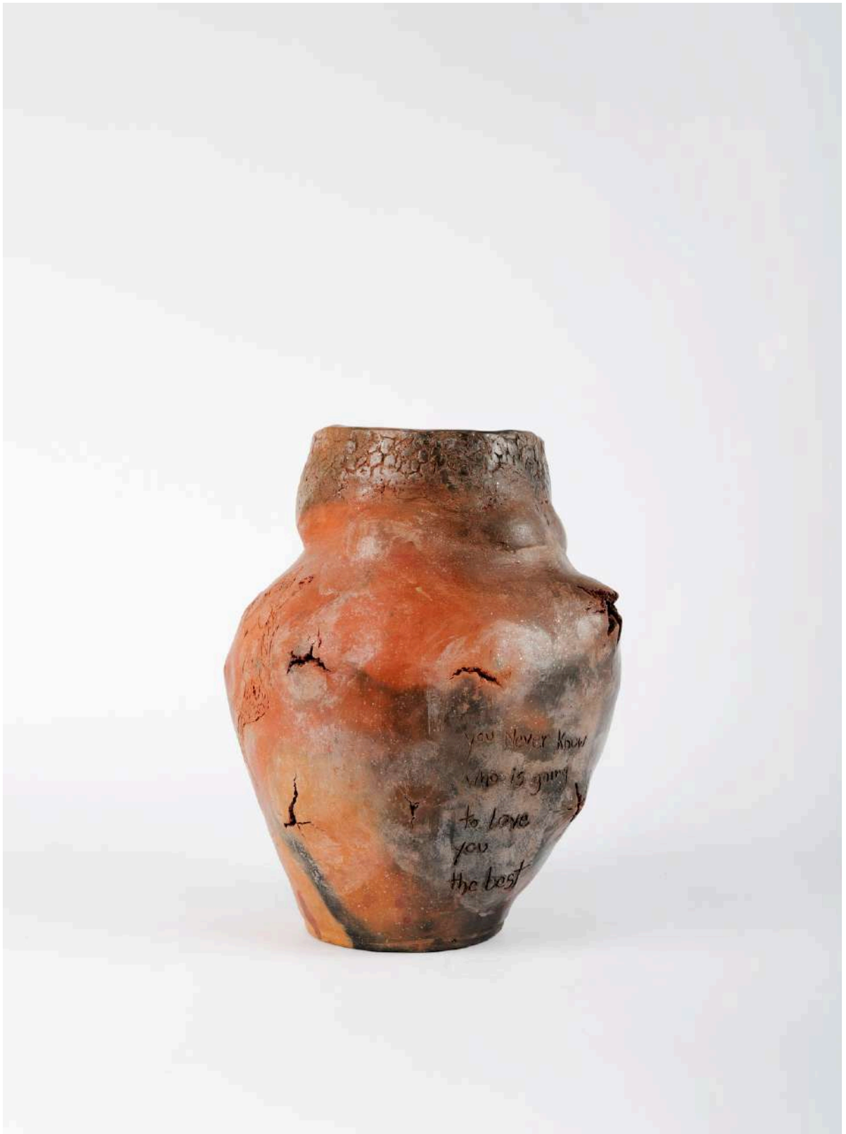
"Tik Tack Toe" wild spanish clay, pit fired ceramic bottle. 22 x 28 cm. 2023