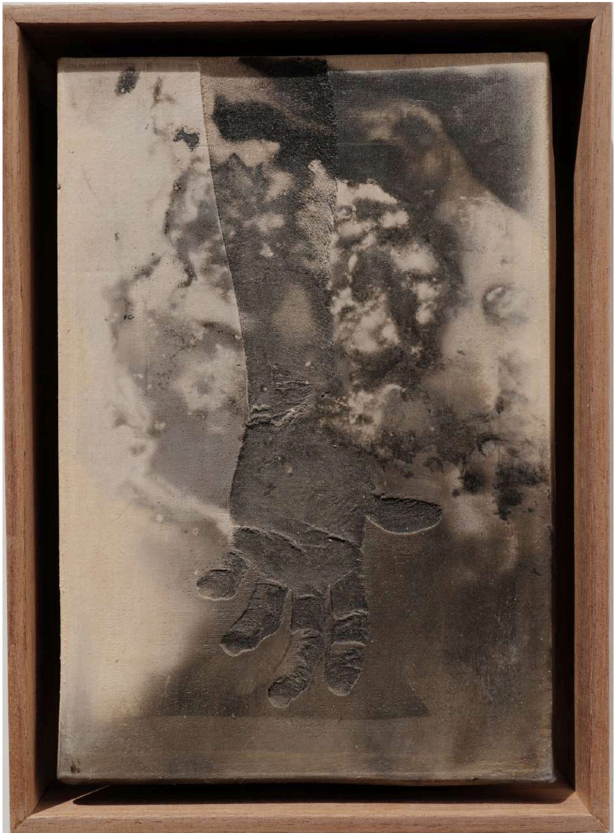
01 "Never Bite The Hand That Feeds You", Photographic Ceramic Impression, Pit Fired, Framed, 13x20 cm 2025