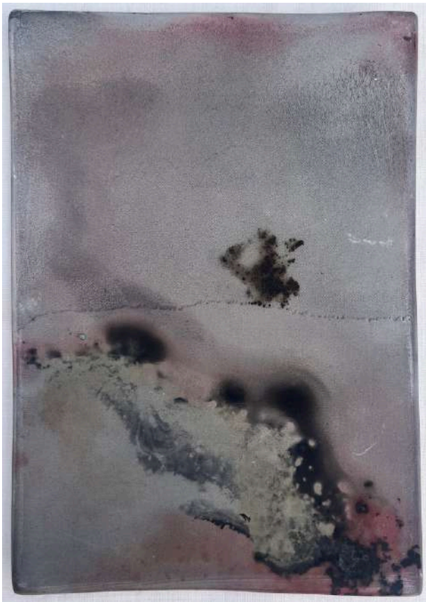
O4, O5 Full Moon Rising Series, Photographic Clay Impression, 12 x 17cm White and Grey Porcelain 2025