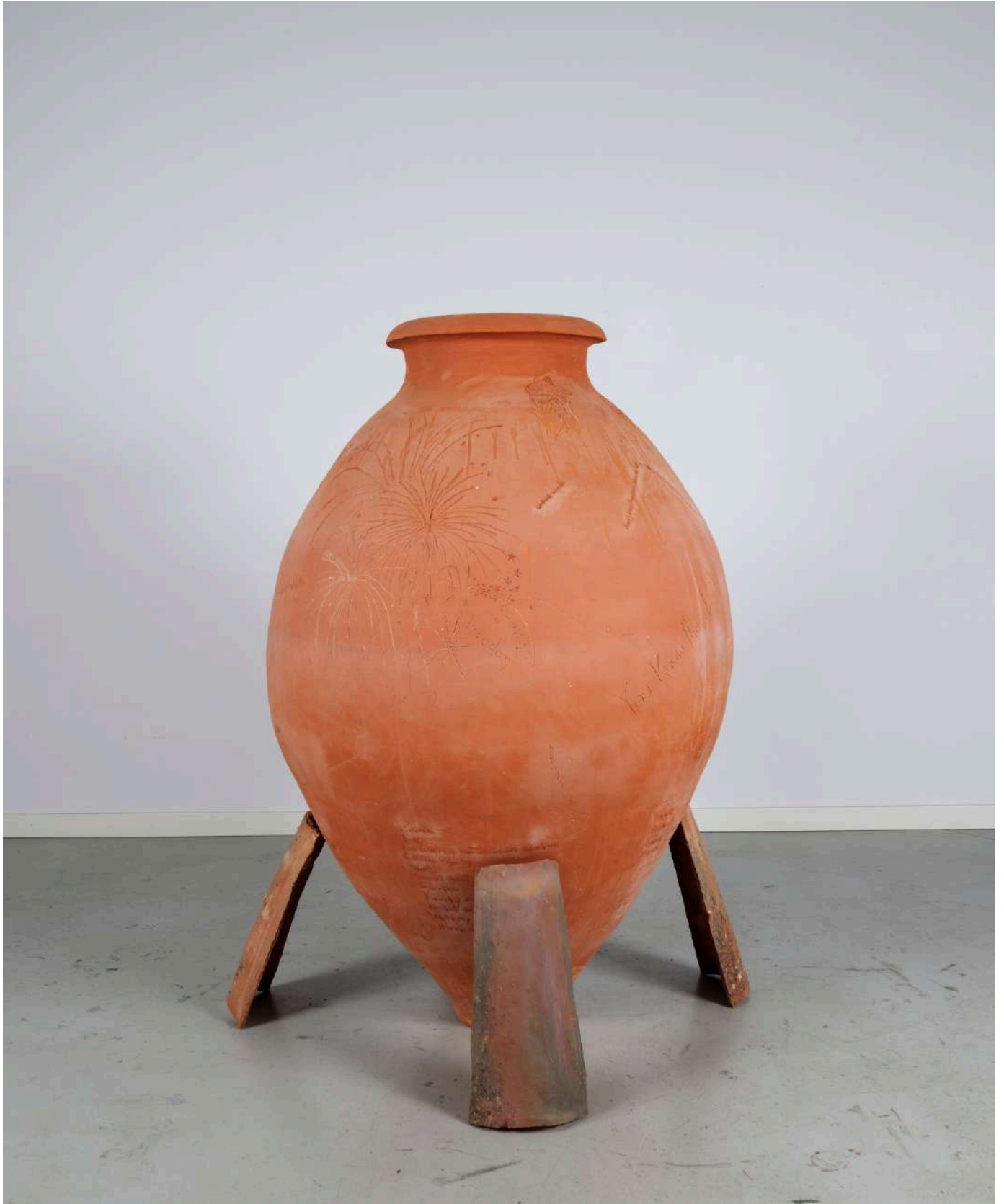
"Selection Theory" wild spanish clay large vessel ceramic work. "La voz es ella" project. 75 x 145cm. 2024