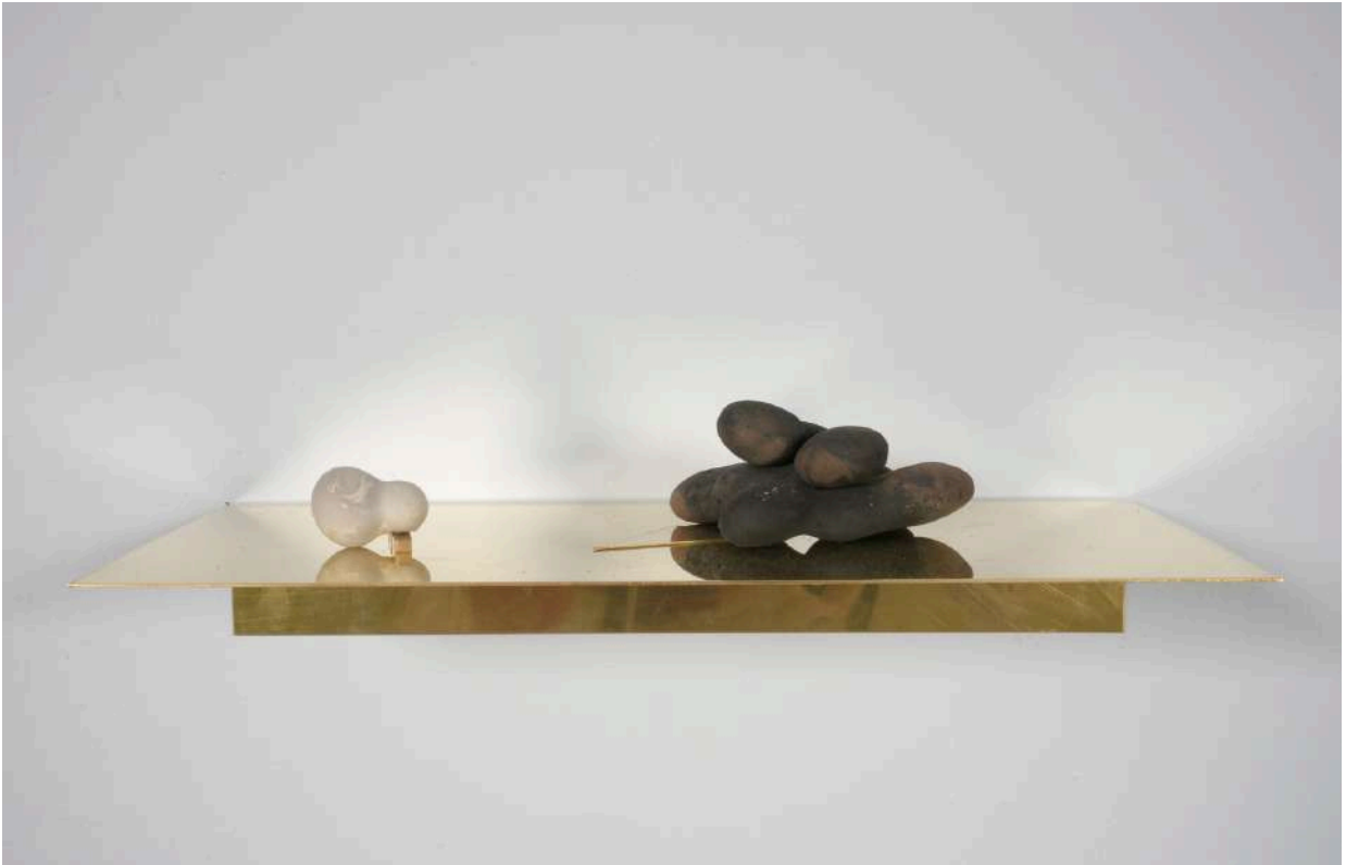
"Big Brothers" sculptural installations of found and reproduced mineraloid opals in clay "idols" from Horno Ciego project. 2023