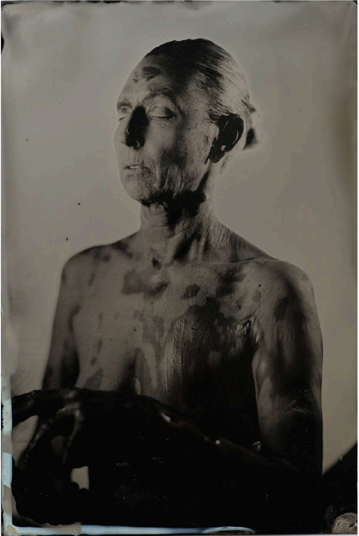
Self portrait covered in clay, Horno Ciego project. 2023