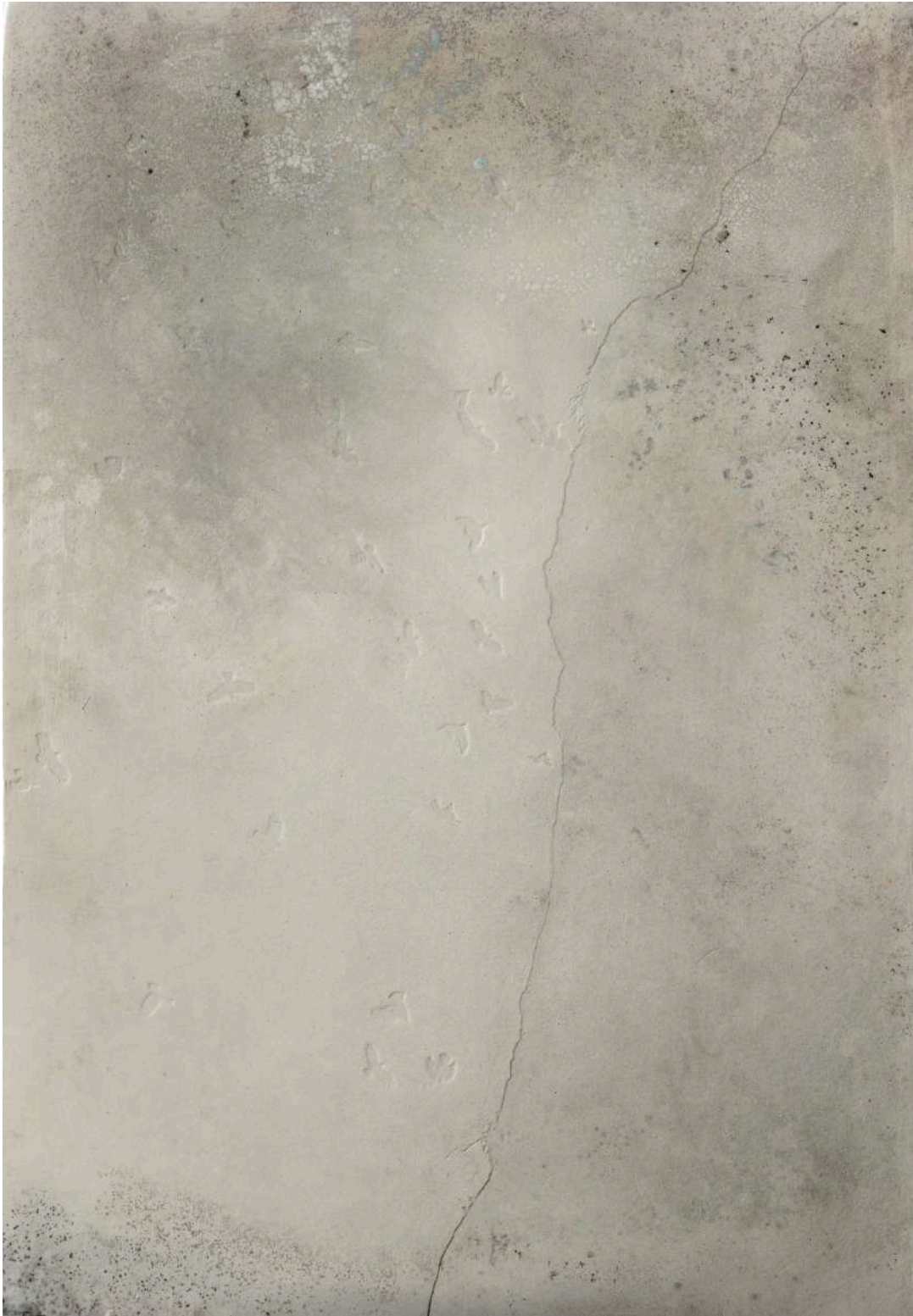
O2 Party of Crows, Photographic Ceramic Impression on White Porcelain, Peñarrubia, 27x19 cm 2025