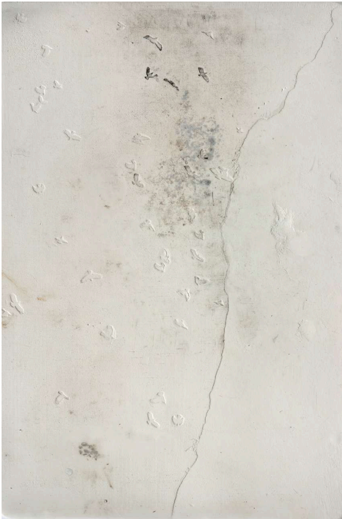
03 Party of Crows, Photographic Ceramic Impression on White Porcelain, Peñarrubia, 27x19 cm 2025