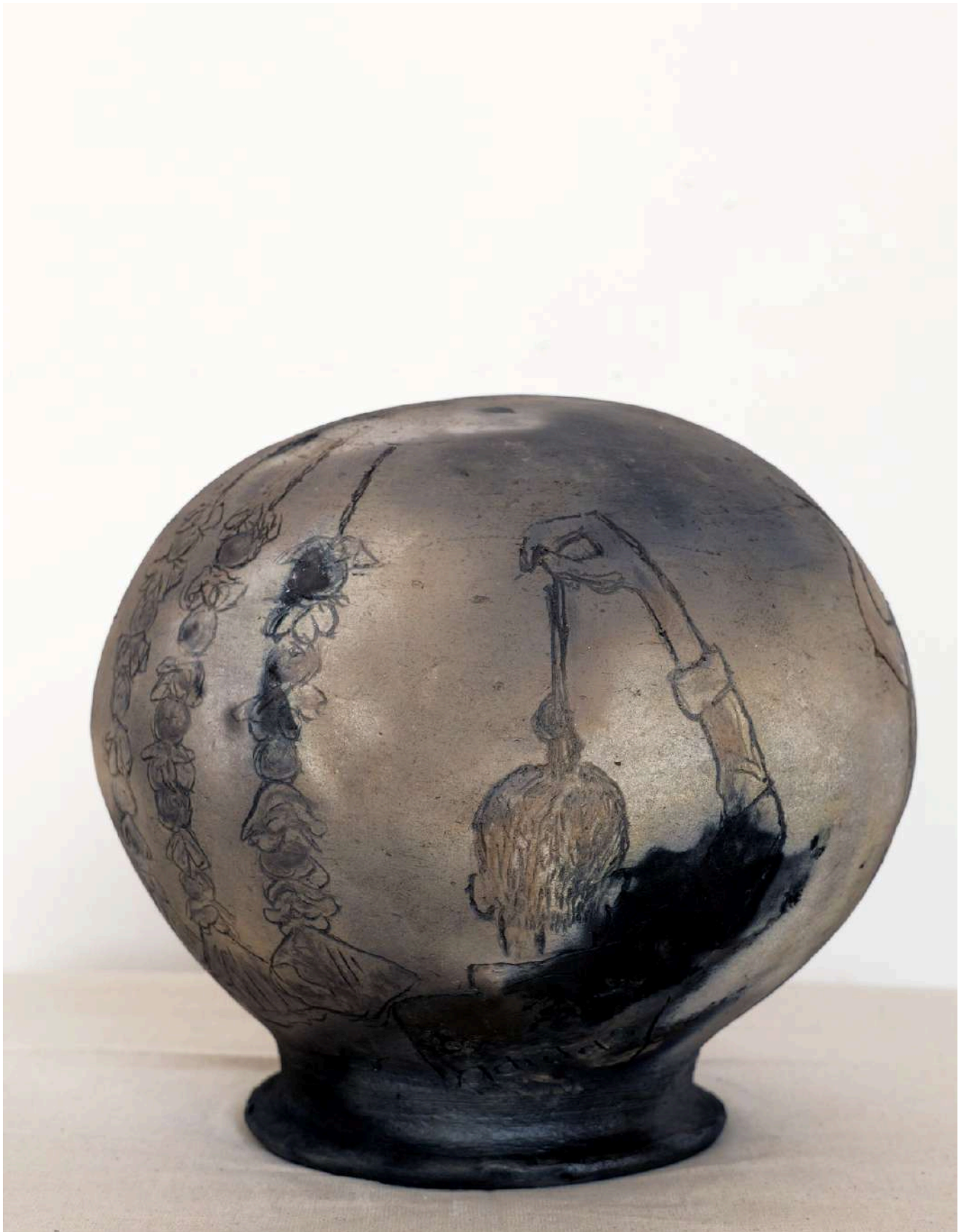
Detail of one of the vessels in "Indian Totem" Jumble project residency Farm Studio India. 2024