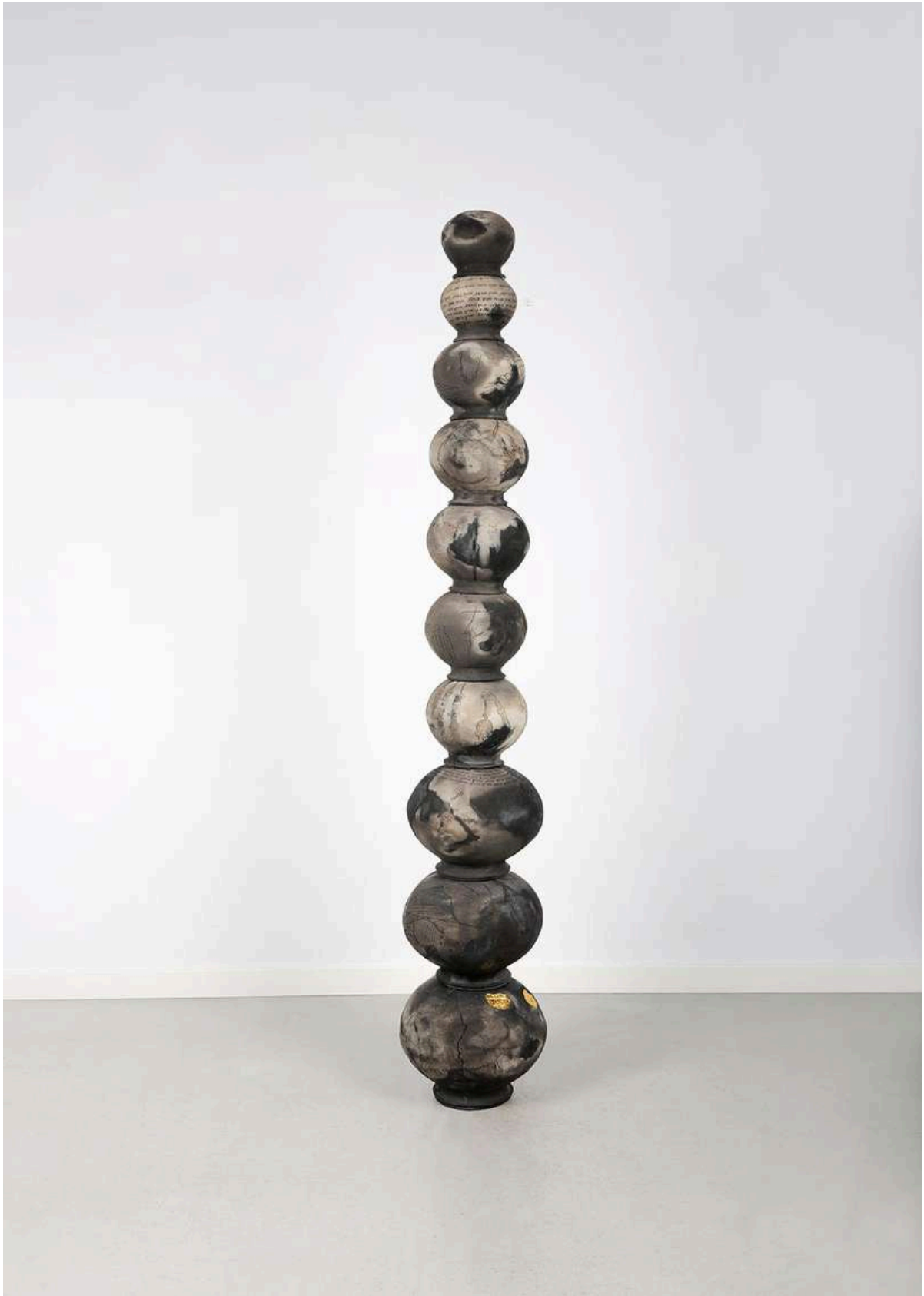
"Indian Totem" Jumble project residency Farm Studio India. 40 x 190cm. 2024.