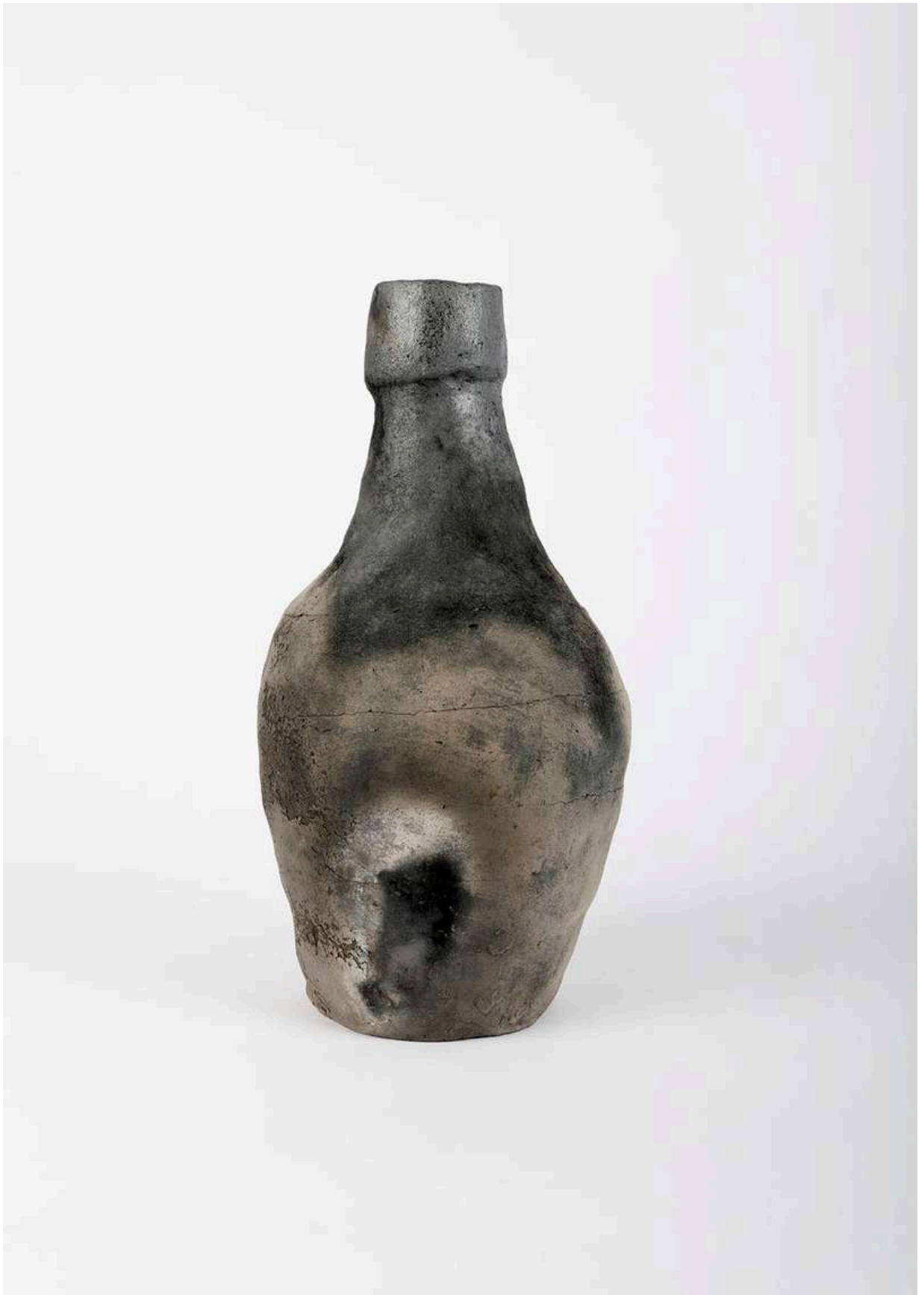
"Buji" wild Indian clay, pit fired ceramic bottle, Jumble project. 12 x 28cm. 2024