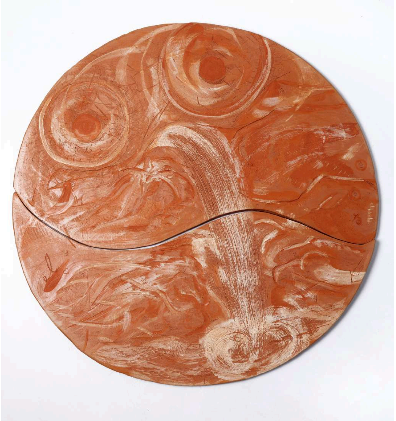
Watching Waterfalls, Ceramic Etched Circle, 40 x 40 cm 2025