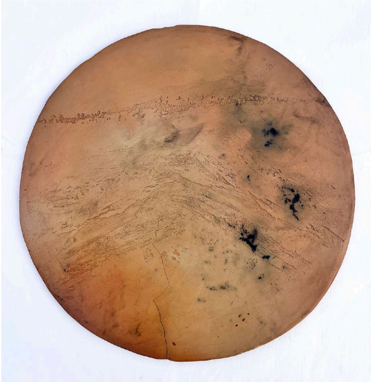
Rio Tus, Photographic Clay Impression, 40 x 40 cm 2025