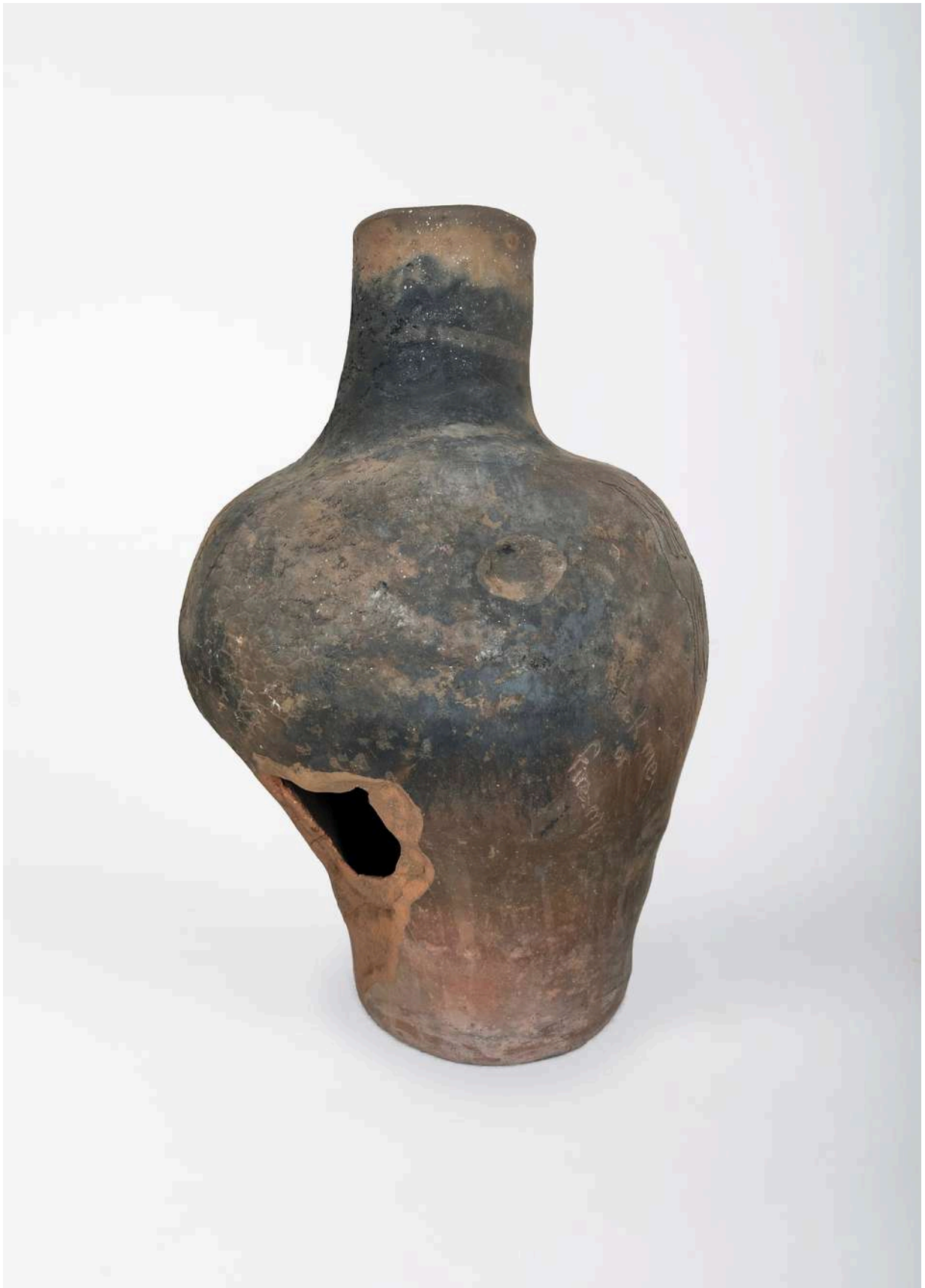
"Catfish" wild spanish clay and pit fired ceramic. 25 x 40cm. 2024