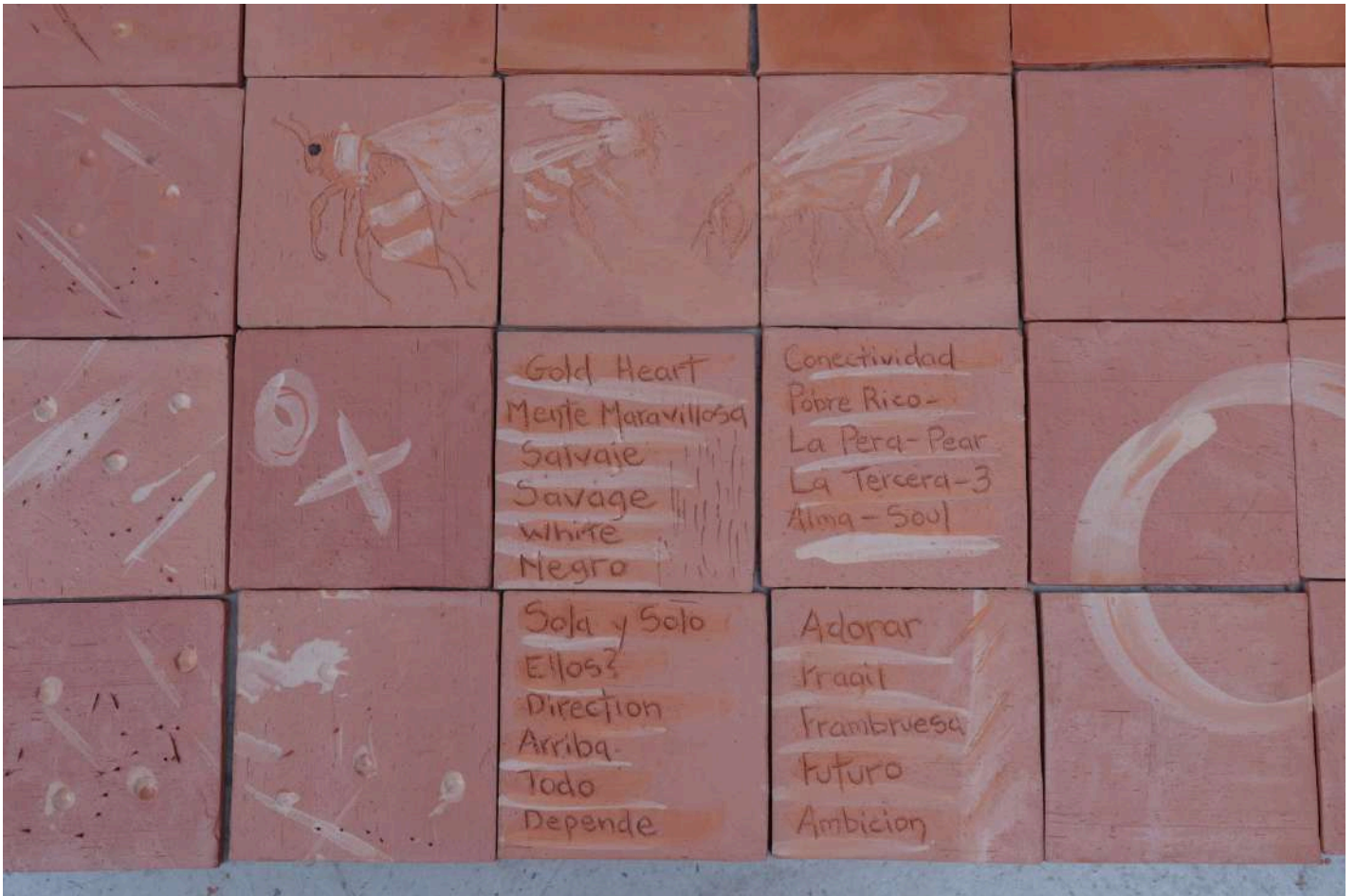
Details of "Las Musas"