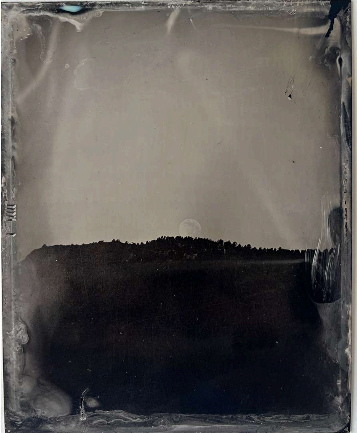
Full Moon Rising, Wet Plate Collodion, Peñarrubia, 4x5 inches 2025