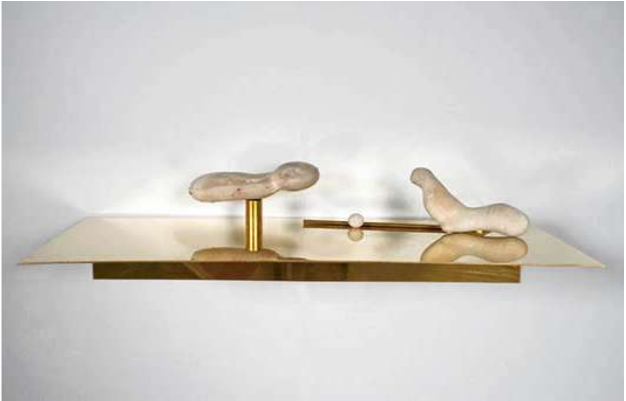
"Balanced Act" sculptural installations of found and reproduced mineraloid opal in clay "idols" from Horno Ciego project. 2023