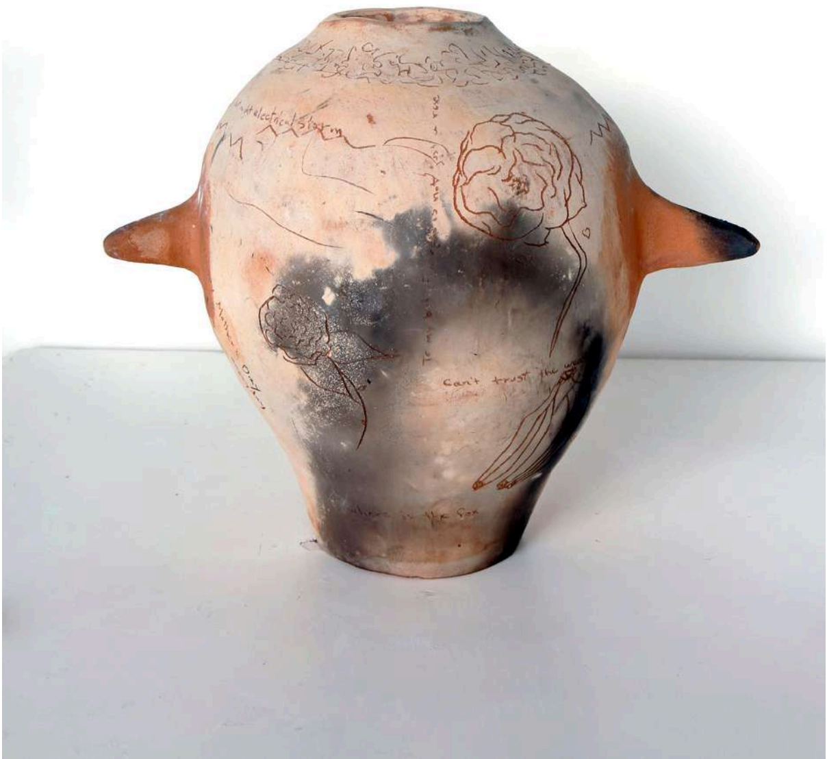
"Electrical Storm" wild spanish clay and pit fired ceramic vessel. 25 x 30cm. 2022