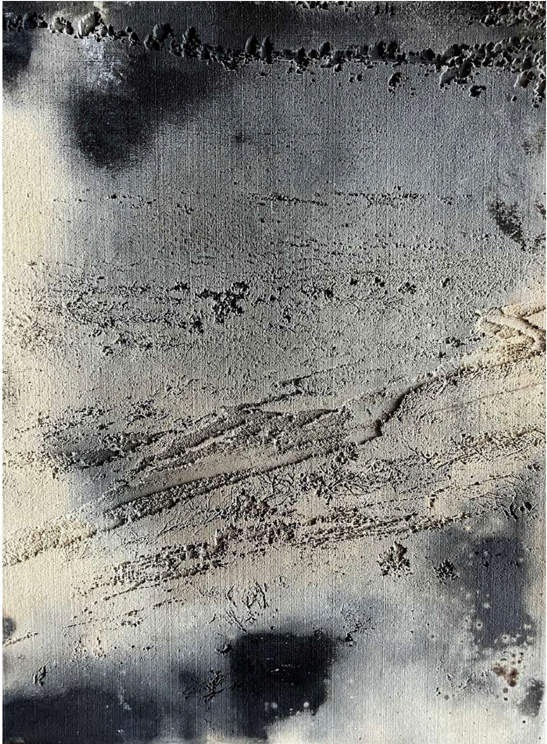
"Rio Tus", clay pit fired engraving from photographic still life. 21 x 29cm. 2025