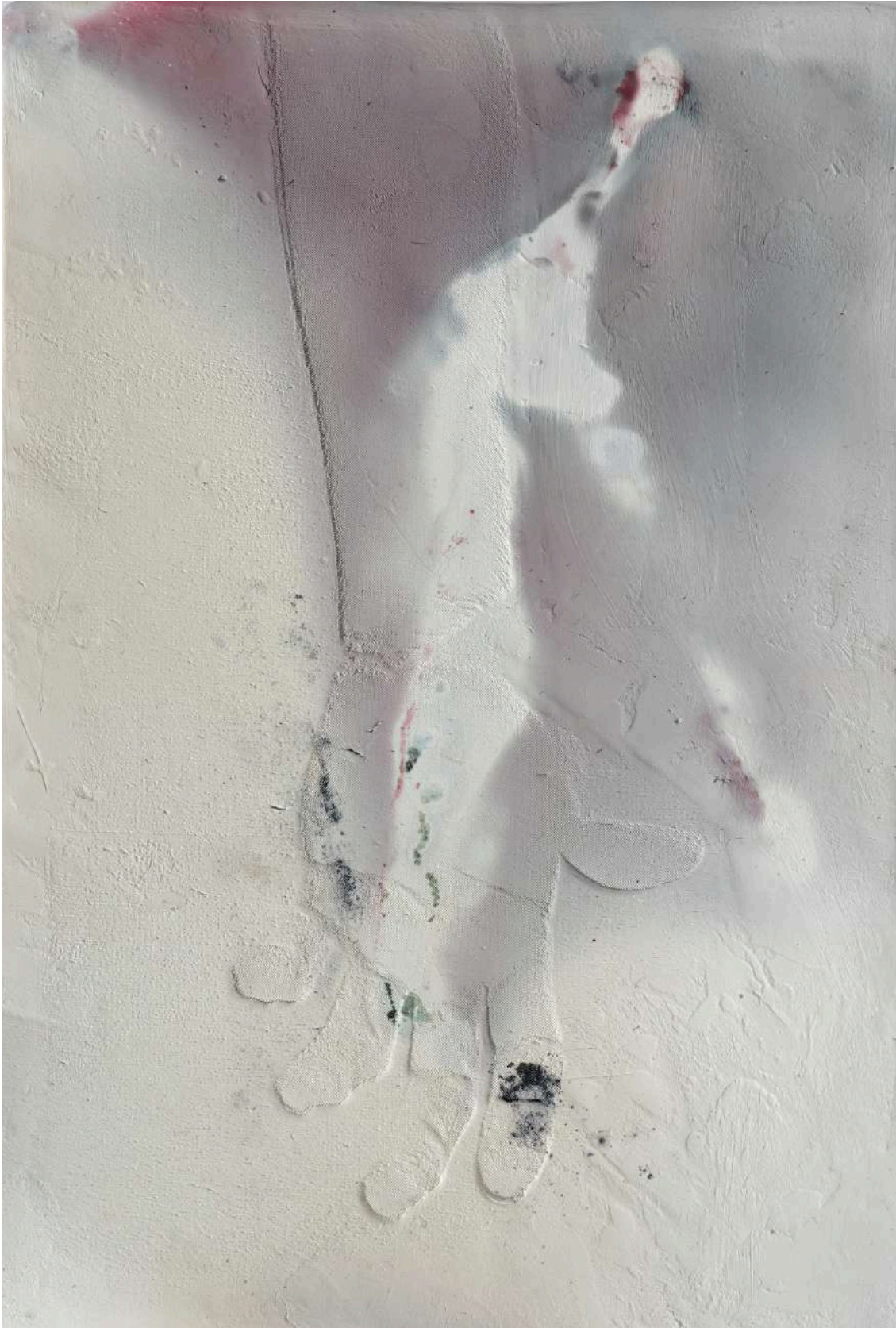
O2 "Never Bite The Hand That Feeds You", Photographic Ceramic Impression, Pit Fired, Framed, 13x20 cm 2025