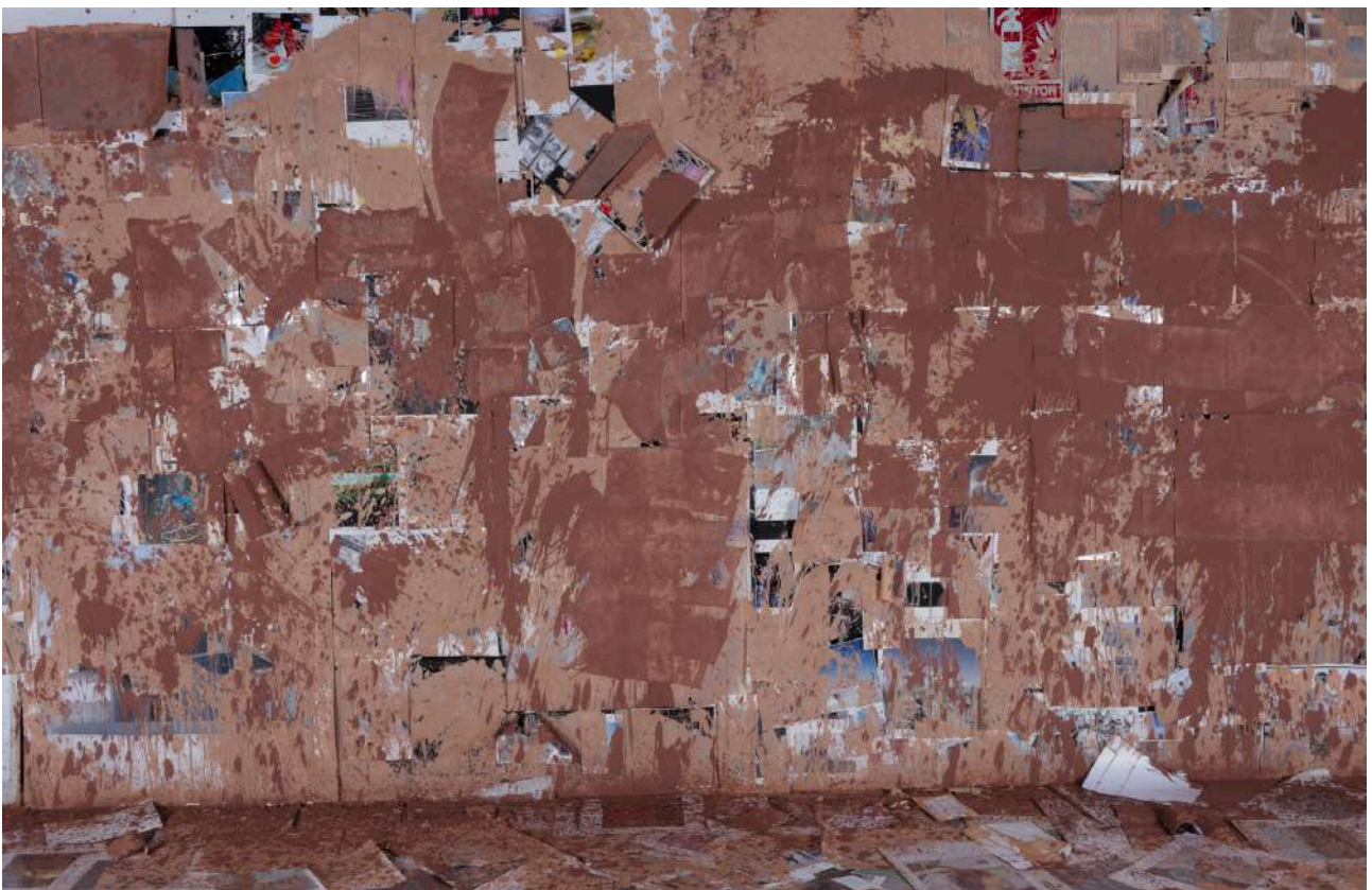
Current work in progress, photographic installation with clay intervention in video performance format and photographic still lifes.