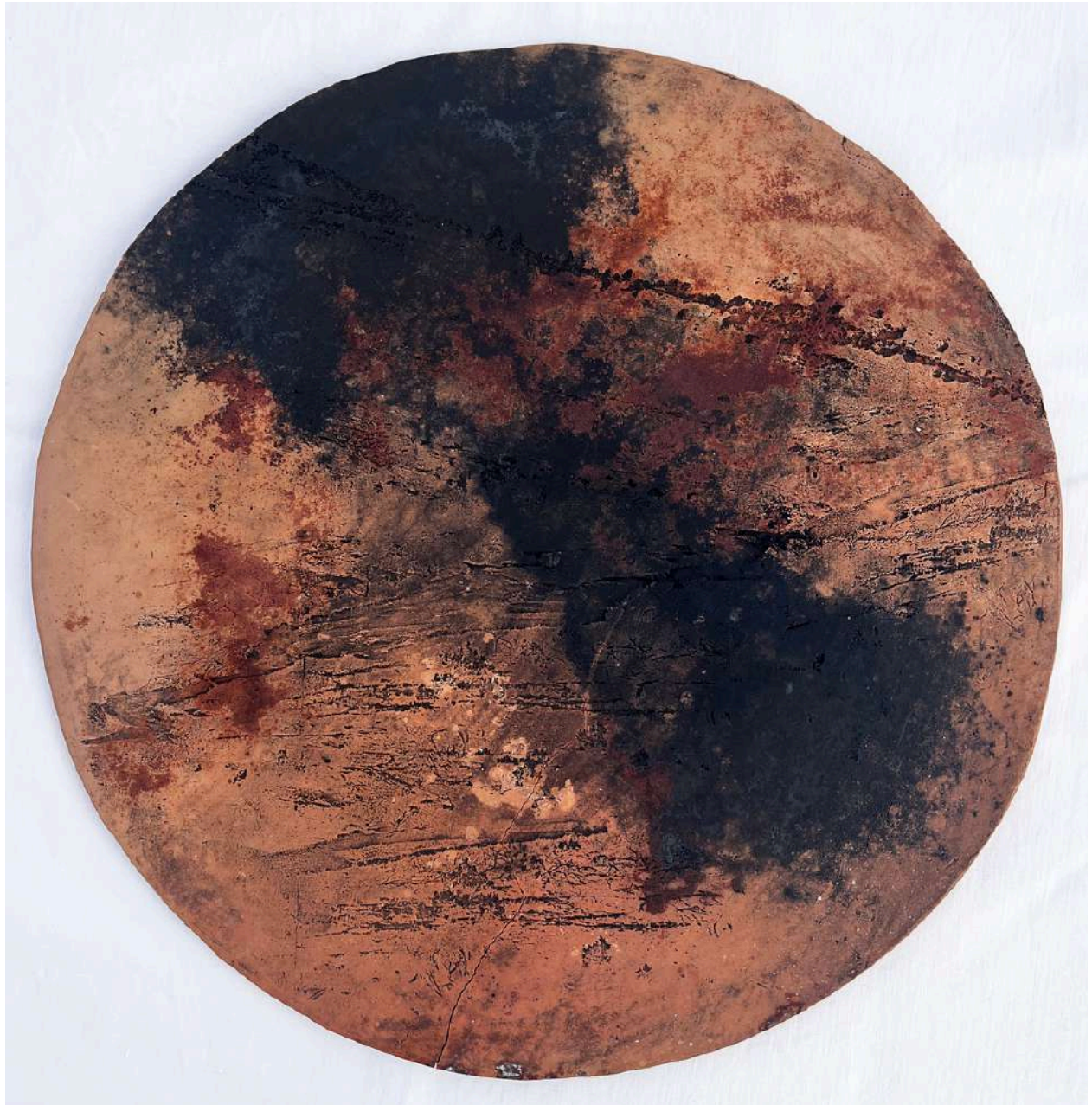
Rio Tus, Side 2, Photographic Clay Impression, 40 x 40 cm 2025