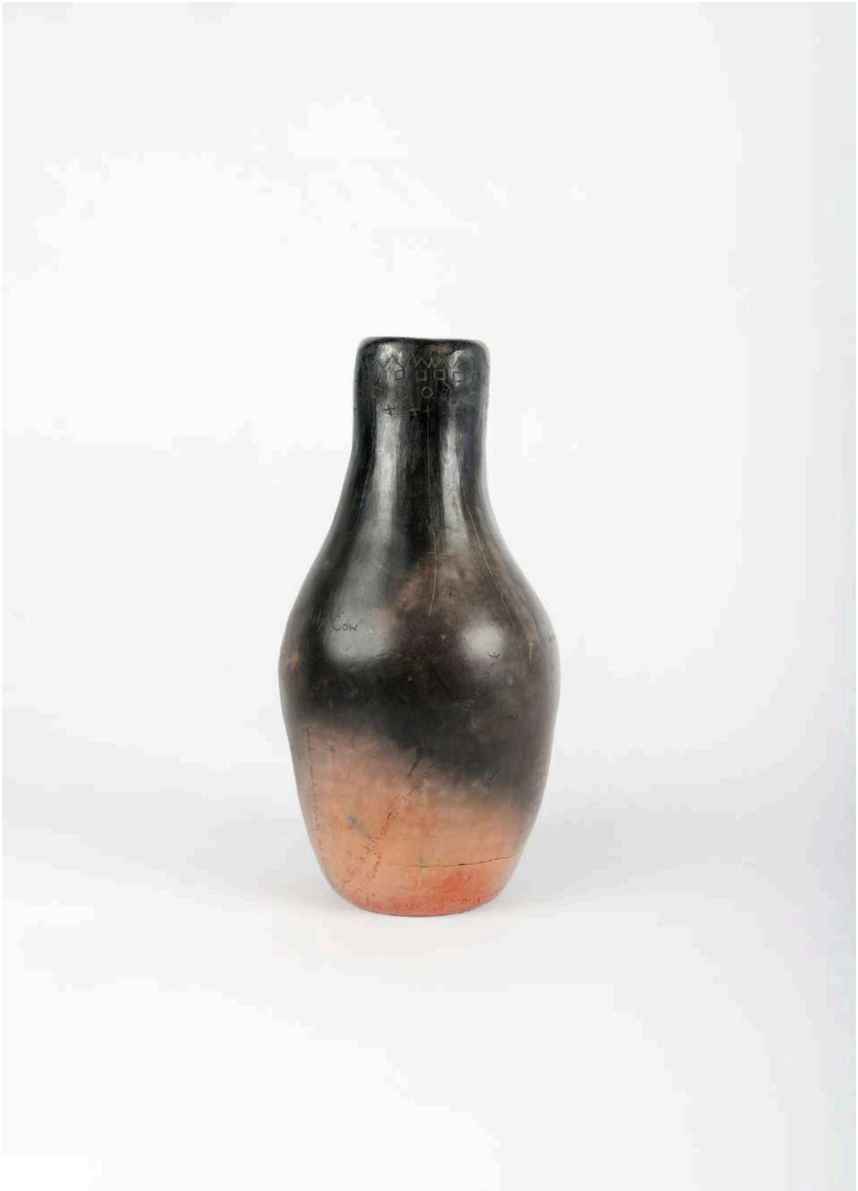
“Holy Cow” wild spanish clay, pit fired ceramic bottle. 12 x 25,5 cm. 2023