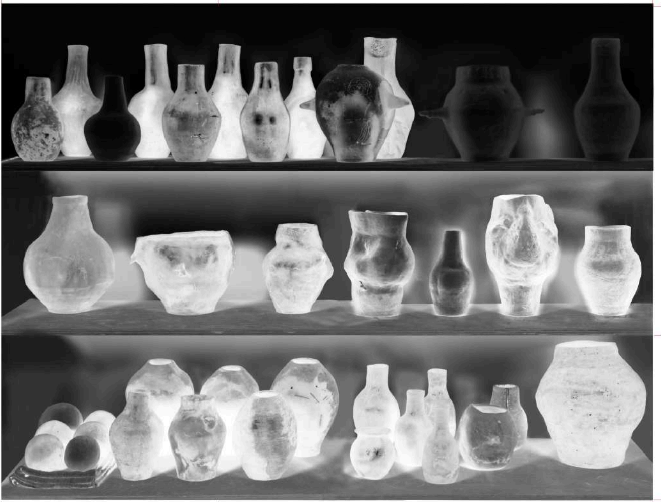
"The artists vessels" inverted photographic still life. 2025