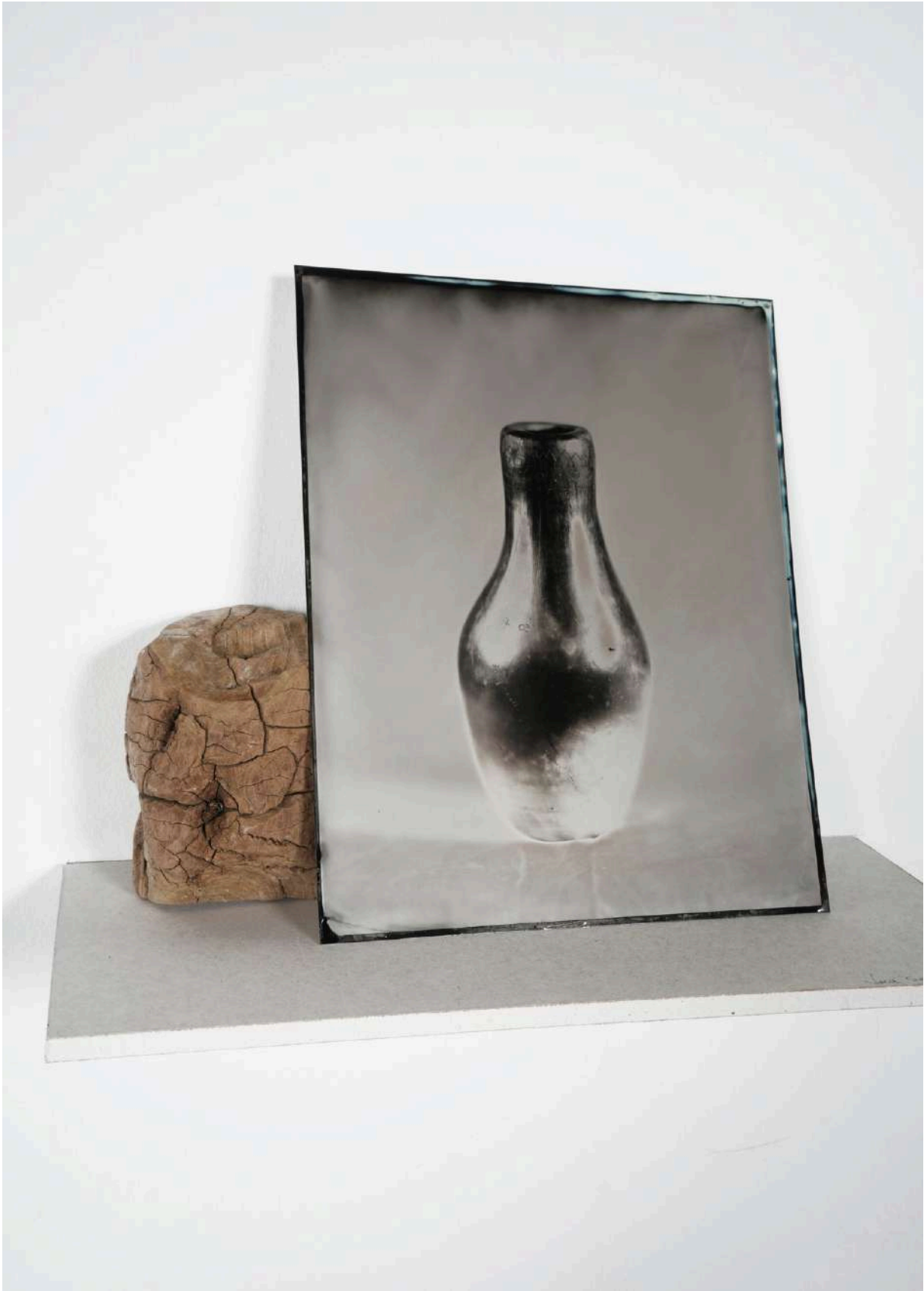
Still life of "Holy Cow" bottle , wet plate collodion, Horno Ciego project. 2023