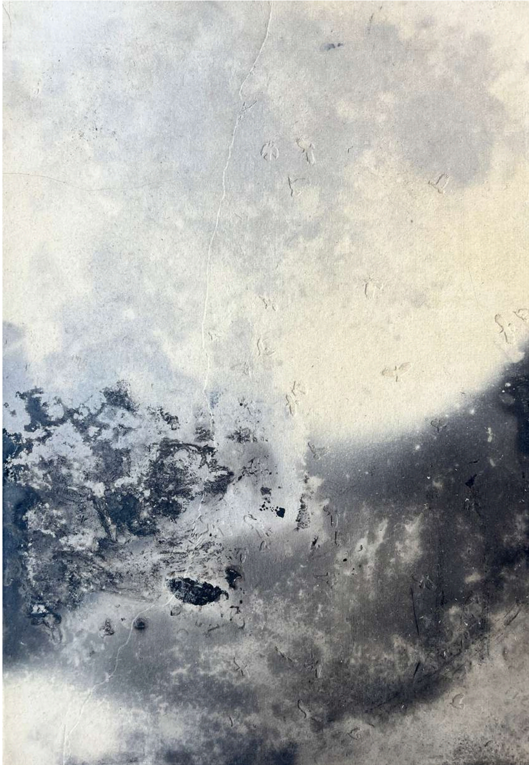
01 Party of Crows, Photographic Ceramic Impression on White Porcelain, Peñarrubia, 27x19 cm 2025