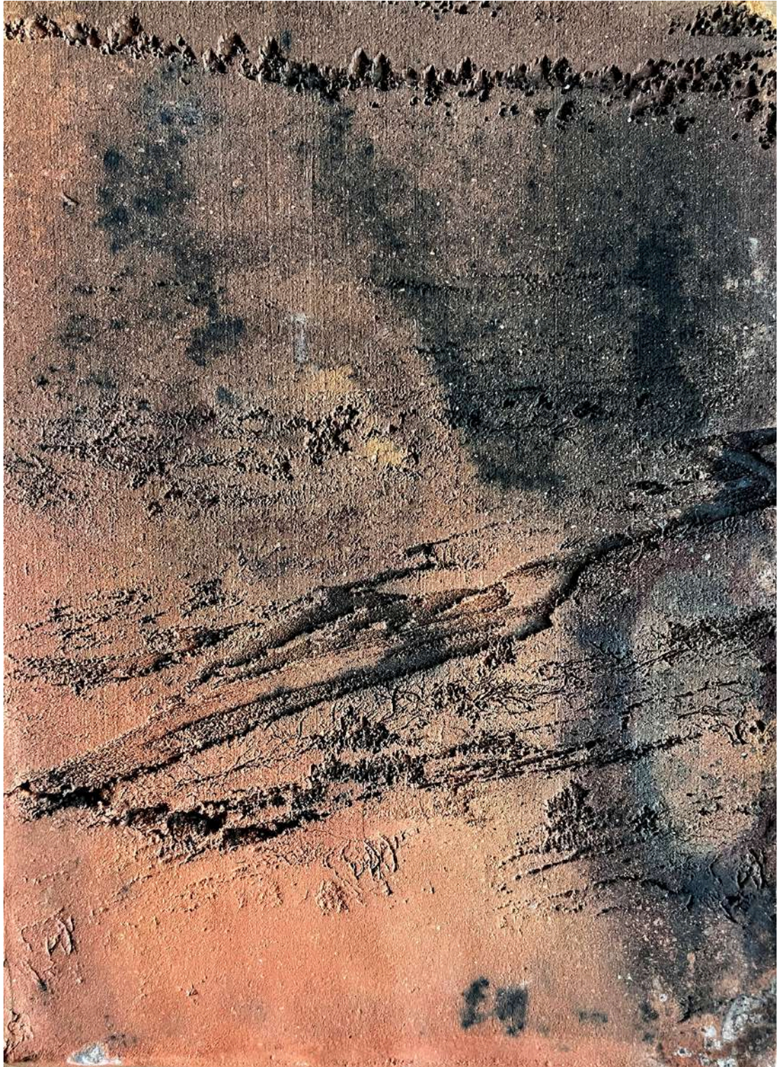
"Rio Tus", clay pit fired engraving from a photographic landscape. 21 x 29cm. 2025