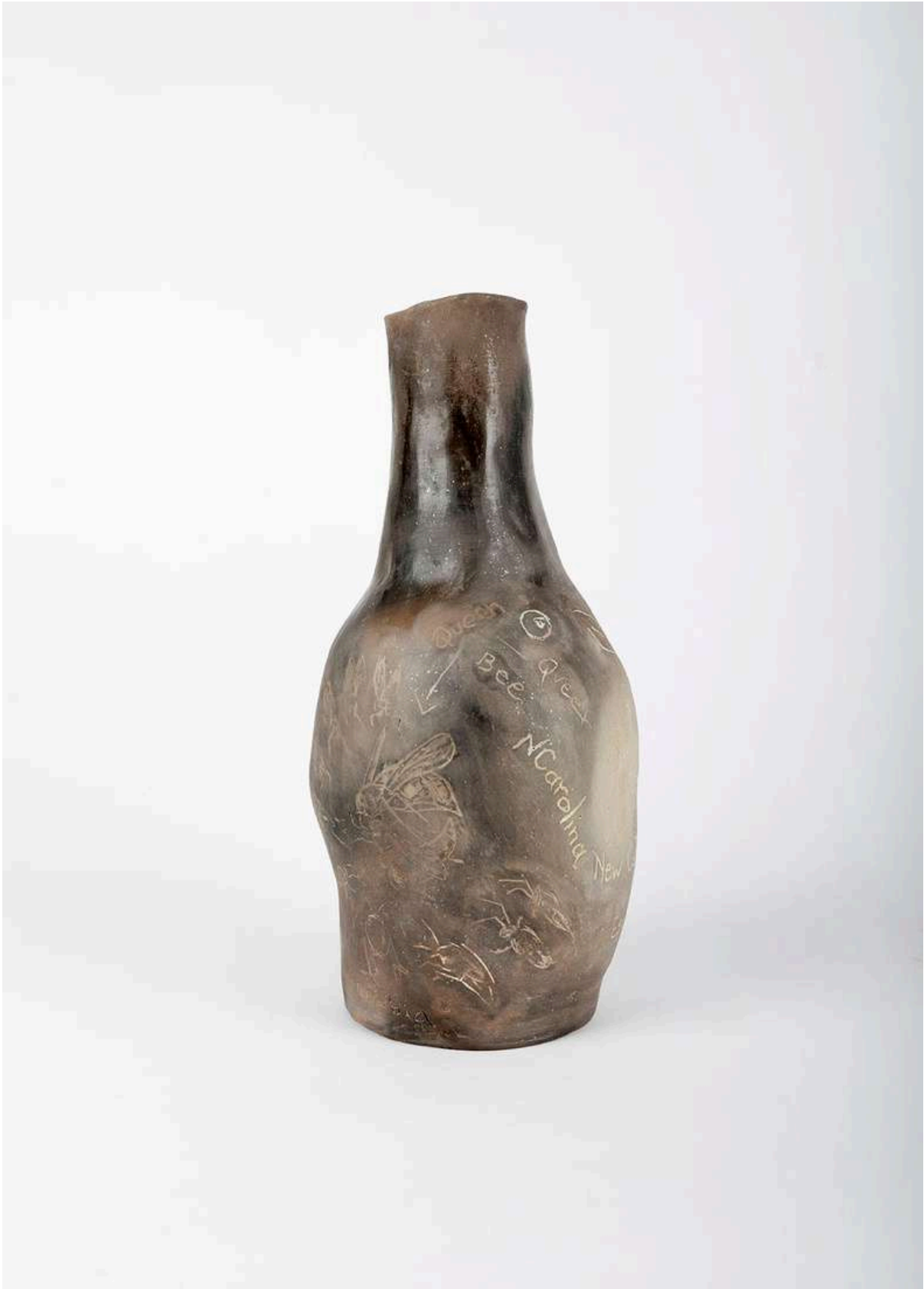
"Loyalty" wild North Carolina clay and pit fired ceramic bottle. 13 x 21cm. 2024